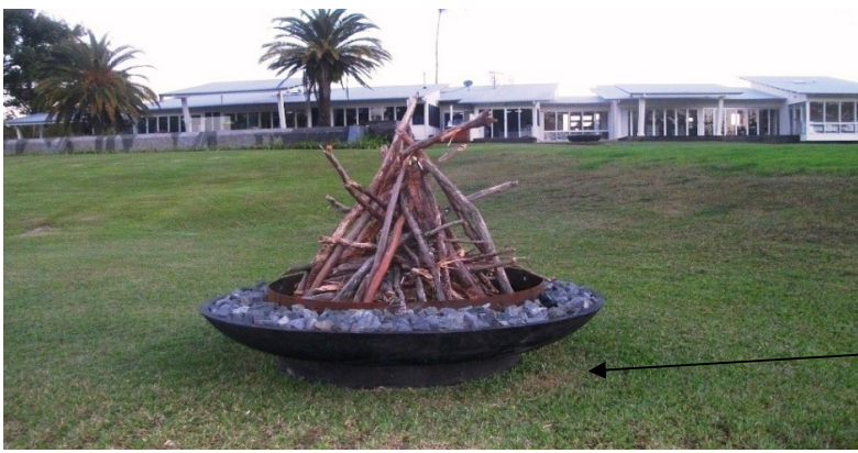
Circular base ring

These fire pits were originally designed for campgrounds where child anti scald requirements are paramount.